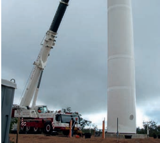
The Weather Watch Radar Tower was trucked on semitrailers from Adelaide then assembled and raised on site.