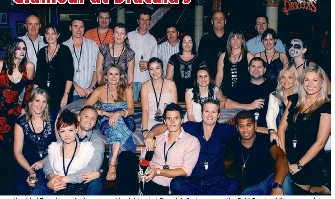
Hutchies' Tweed team had a memorable night out at Dracula's Restaurant on the Gold Coast, adding some colour and glamour to the usually scary venue.