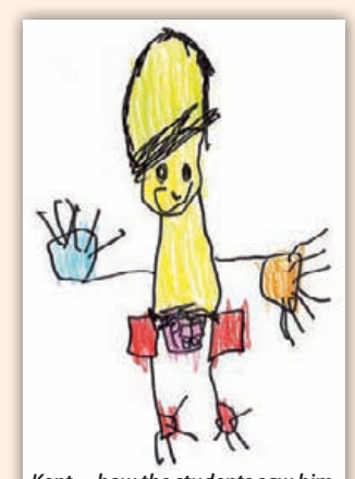
Kent ... how the students saw him.

The 3441 km ride was accomplished in just under three weeks, raising funds for mental health