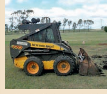
Hutchies' bobcat on the job.

MANY hands, teamwork and a bobcat made light work at a recent working bee at the Wyreema State School in Toowoomba.