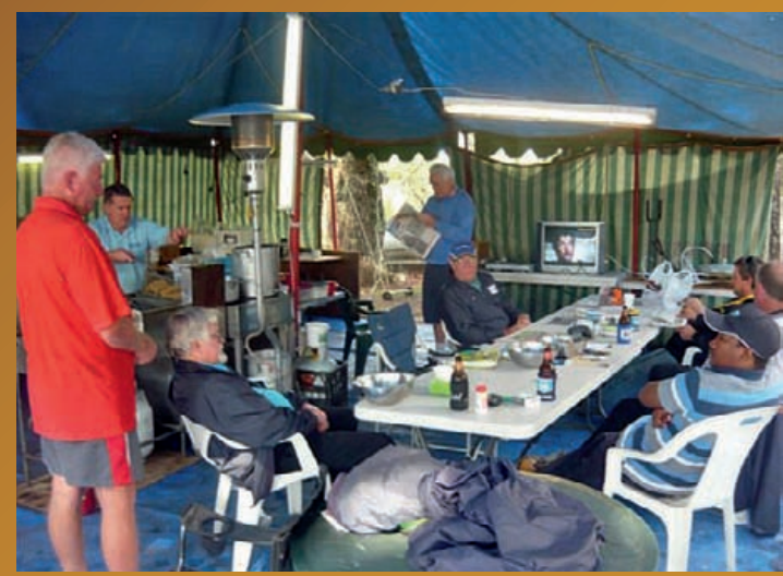
Team members are shown in their home away from home.